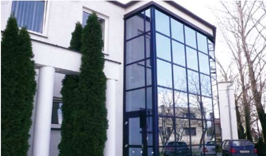
▲ Located in Piestany, has a factory of 1,000m 2 .