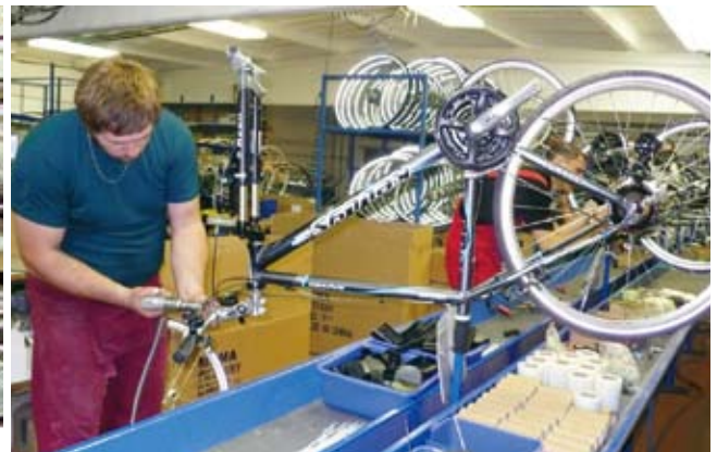
▲ Assembling cycles at MaMa.