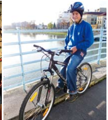
▲ This man was riding a Kellys bike.

Ma Ma markets its Kellys brand throughout Eastern Europe, and even in Western Europe and Russia. Because of its dedication to service and quality, Ma Ma is quite insistent on selling bikes only under its brand name, and not engaging in any contract production for other brands. As a result, customers consider the