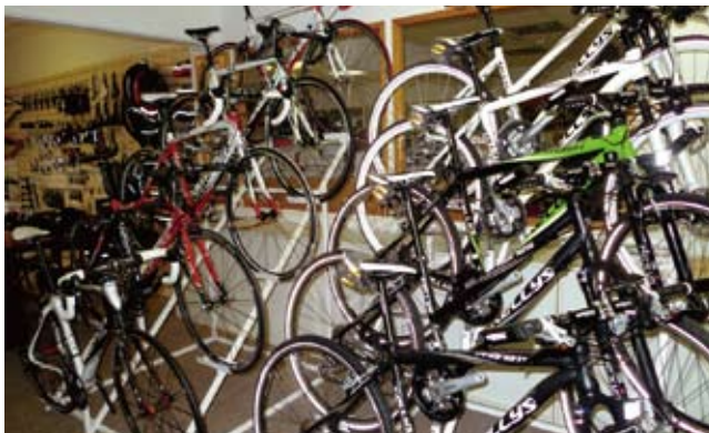
▲ The Kellys brand, already well-known in Eastern Europe, has recently expanded into the EU market.