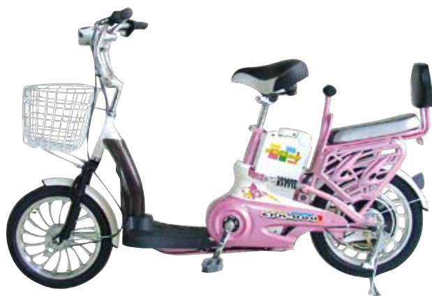
▲ Functional, high-quality Pretty Wheel e-bikes have won consumers' hearts.