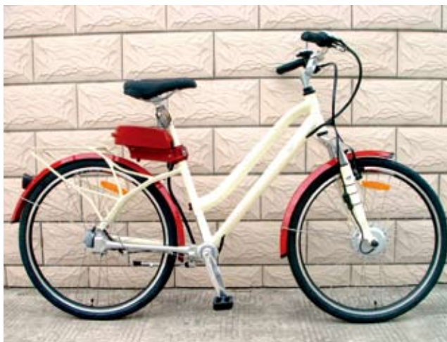
▲ Italian Prime Minister Silvio Berlusconi's e-bike was made by Pretty Wheel.